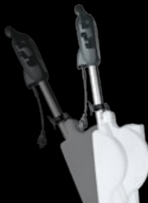
FM33/43 G - FM43 DS

FM43 DS is a dual speed belt driven single disc machine, cable powered, with large tank capacity and 43 cm working width. It is extremely low-noise and suitable for: scrubbing, maintenance cleaning and polishing synthetic, vinyl and carpet floors.