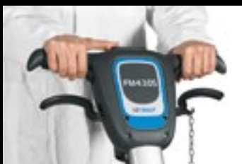
FM33/43 G - FM43 DS

They are equipped with a safety system through which the machine activation depends on the simultaneous pressure of the handlebars levers and dead's man button. When the levers are released the machine stops