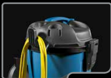
Handy cord holder