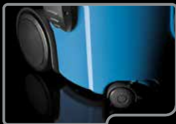
The big rear wheels and the front swivel ones ensure stability and manoeuvrability

It is equipped with a 700 W motor and is suitable for a professional use. It is ideal for the daily cleaning of small and medium areas such as offices, hotel rooms or shops.