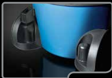
The handy accessory holder enables to work with all the accessories within easy reach