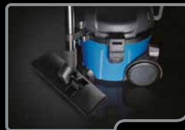
The suction tube holder is very useful for storing the vacuum cleaner