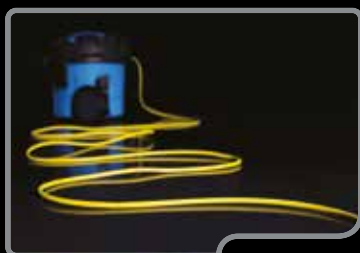
The 10 m high visibility cable allows to work safely and comfortably also in wide areas.